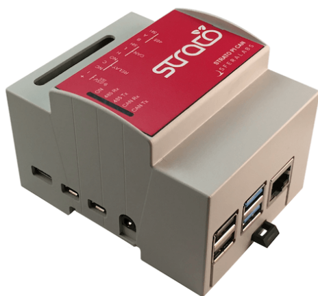
Figure 3: Sfera Labs' Strato Pi CAN is a Raspberry Pi server tailored for industrial and automotive applications where reliability and service continuity are key

The result was Strato Pi CAN , which is now available to all Sfera Labs' customers. It comes with the CANBus interface (capable of transferring data at a 1Mbit/s data rate) directly incorporated. For data protection purposes, a Microchip ATECC608A secure element chip is included. In addition, an opto-isolator mitigates the threat posed by electro-static discharge (ESD) strikes.