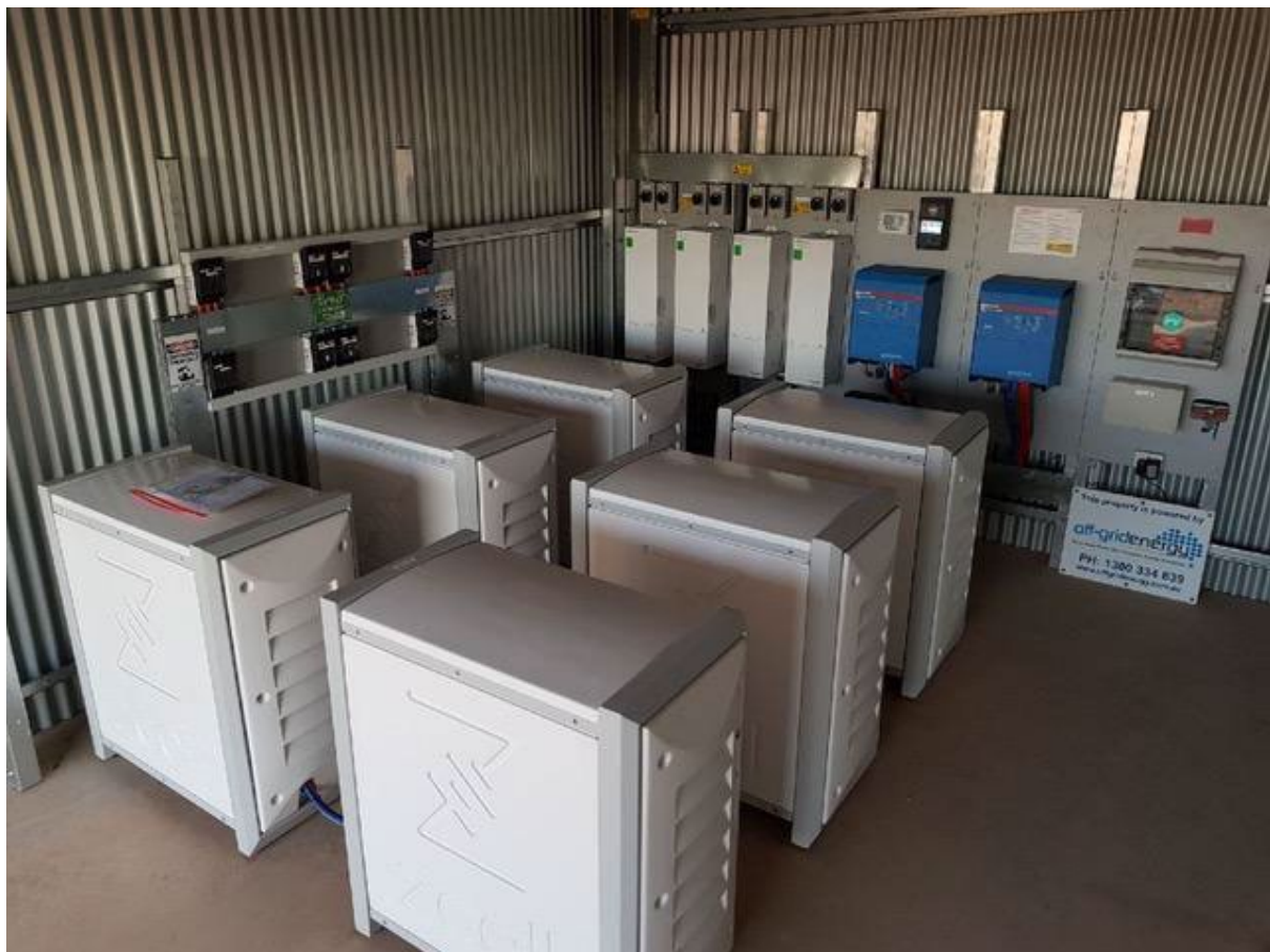
Figure 1: Z-cell battery in housing; Sfera Labs' technology deployed in a Redflow battery energy site

The modern technology landscape sets difficult challenges on a regular basis. Having access to standard off-the-shelf hardware does not always prove to be enough. Pressures to optimise operation as much as possible and to fit in with specific application criteria often mean the modifications to existing products will be necessary. On numerous occasions, Sfera Labs has shown that it can adapt items from its product portfolio to suit customers' exacting requirements. As we will see, the work that it undertook for battery manufacturer Redflow is a prime example.