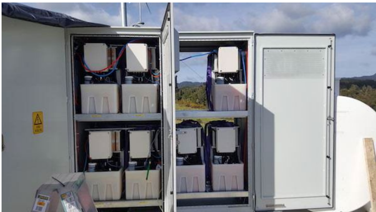
Figure 4: Redflow batteries being used by Vodafone New Zealand for remote energy storage

Utilising Sfera Labs technology, the Redflow BMS is now fitted as standard in every site deployment of Redflow batteries. The reliability of the hardware has been underlined by the fact that the company has not witnessed a single field failure in any of its many installations. It has meant that Redflow clients can have complete confidence in the ongoing operation of their energy storage system - with both elevated performance and the highest degrees of safety always being a certainty.